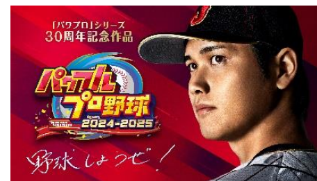
PAWAFURU PUROYAKYU 2024-2025