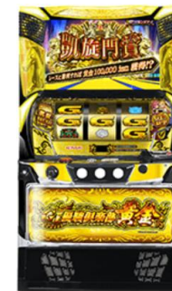
GI Derby Club Gold