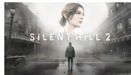
SILENT HILL 2