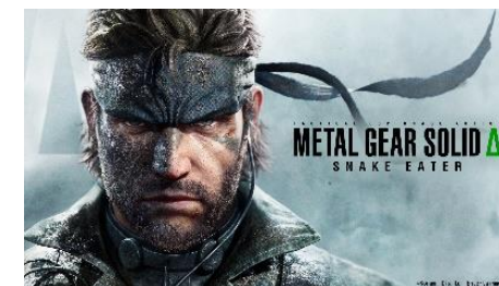
METAL GEAR SOLID Δ: SNAKE EATER