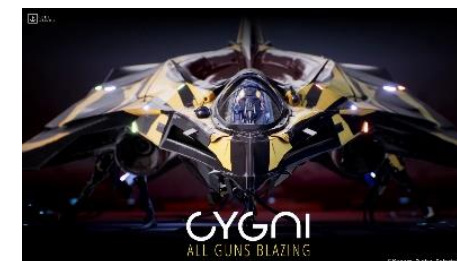
CYGNI: All Guns Blazing