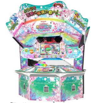
ColorCoLotta Maboroshi no Togenkyo