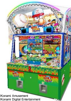
PAWAFURU PUROYAKYU KAIMAKU MEDAL SERIES!