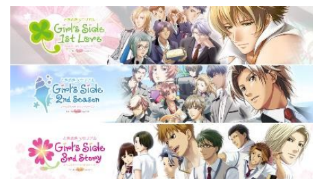
Tokimeki Memorial Girl's Side 1・2・3