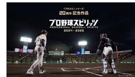
PROFESSIONAL BASEBALL SPIRITS 2024-2025