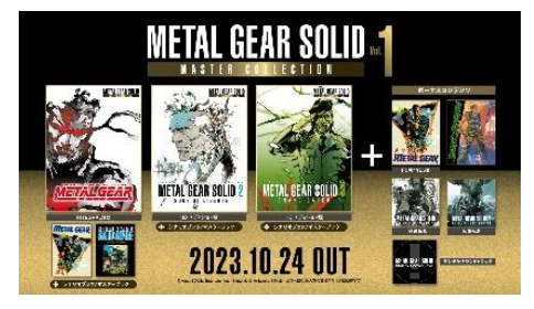
METAL GEAR SOLID: MASTER COLLECTION Vol.1