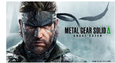
METAL GEAR SOLID \Delta : SNAKE EATER

©Konami Digital Entertainment ©AKIRA SAKUMA ©Konami Digital Entertainment ©KeelWorks Ltd 2023