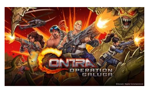
Contra: Operation Galuga