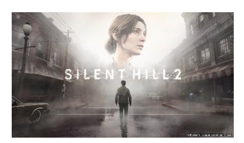
SILENT HILL 2