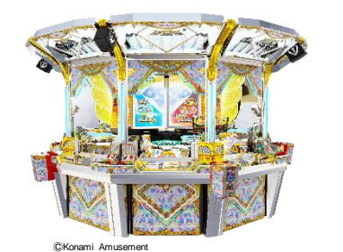
FORTUNE TRINITY Jiku no Diamond