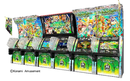
ELDORA CROWN Yukyu no Labyrinth