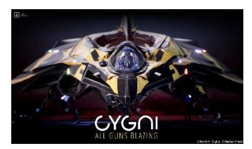
CYGNI: All Guns Blazing