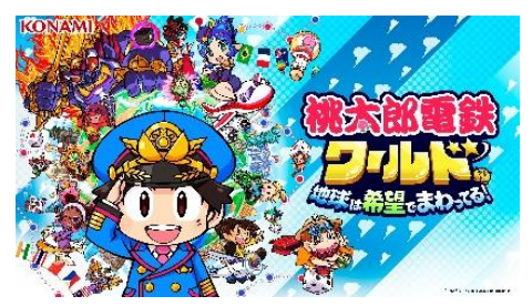
Momotaro Dentetsu World -Chikyu wa Kibou de Mawatteru!-